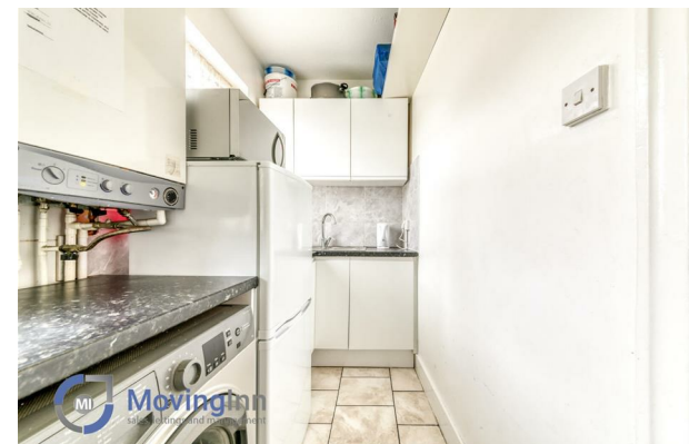
Second Floor 440 sq.ft. (40.9 sq.m.) approx.